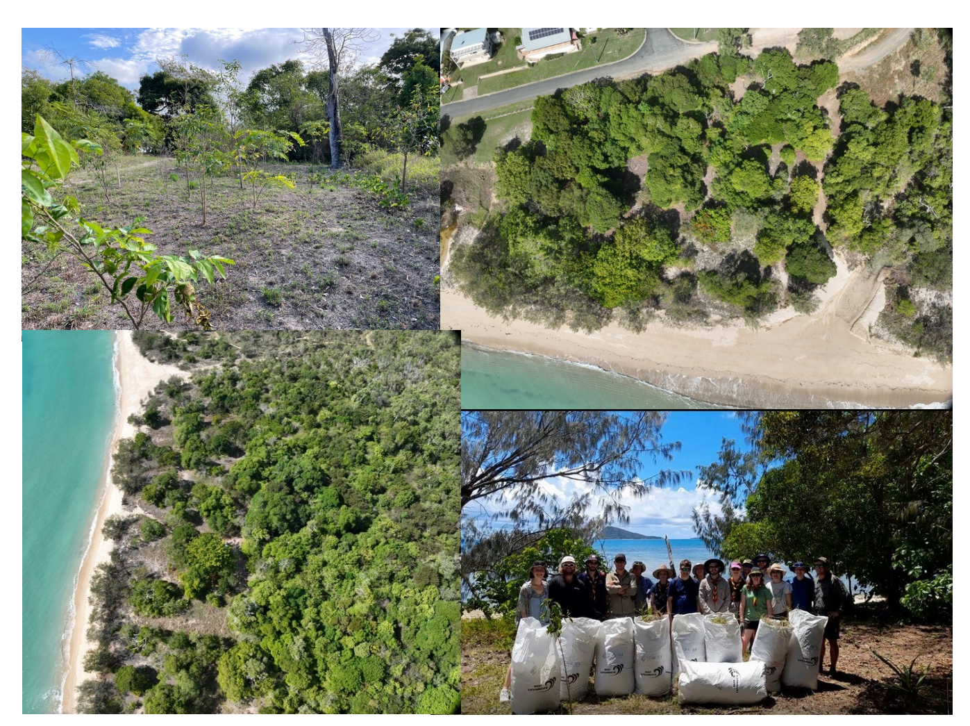
Top left - trees planted at Dingo Beach. Top right: Dingo Beach beach scrub where works have been conducted. Bottom left - Nelly Bay Beach Scrub. Bottom right - Rover Scouts visiting from Melbourne lending a hand with weed control at Nelly Bay.

Gloucester Beaches works from 2019 to 2023 were funded by a Qld Government's Community Sustainability Grant ($31 440) as well as Threatened Ecological Communities funds via Reef Catchments.