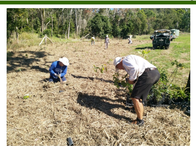
Above: WCL Volunteers planting at the Aldred's property in August 2020.